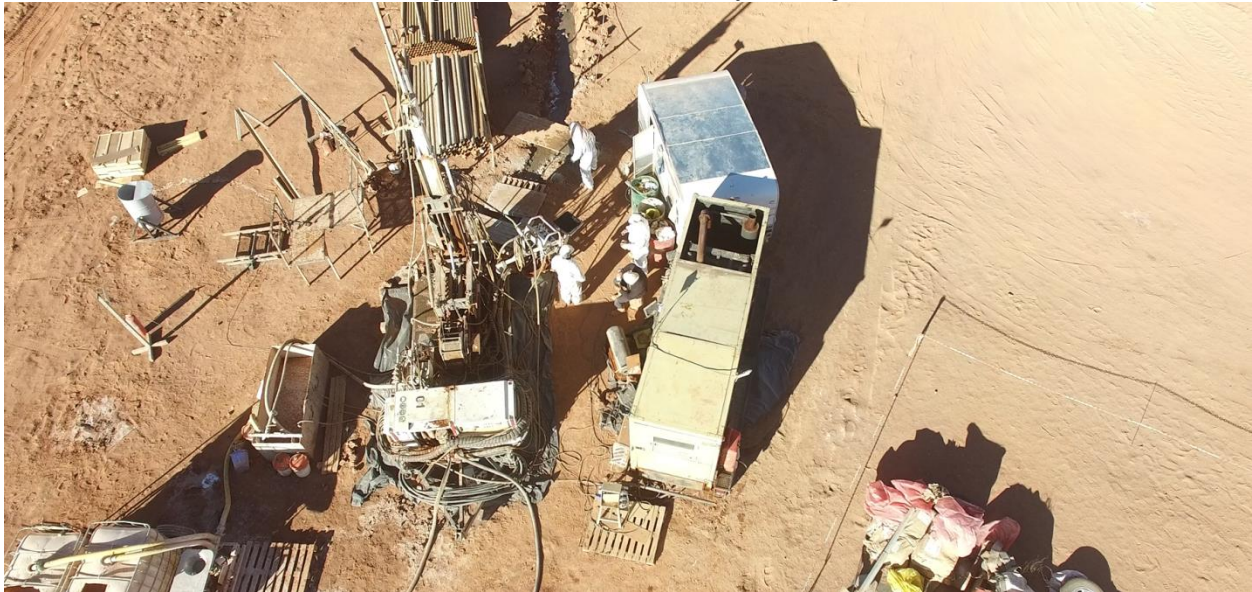
Figure 2. Pocitos 1 Lithium Brine Project Drilling