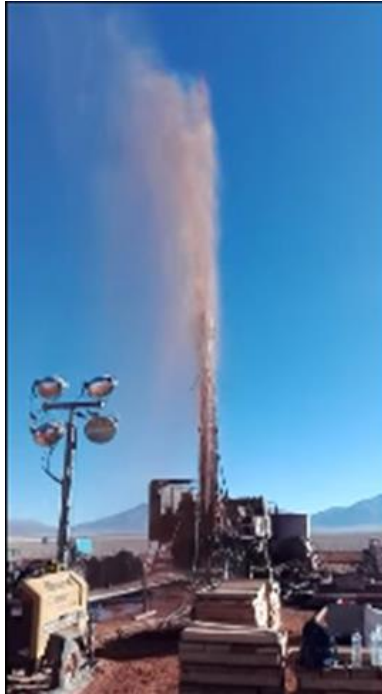
Fig 4. 2018 Drilling at Pocitos 1