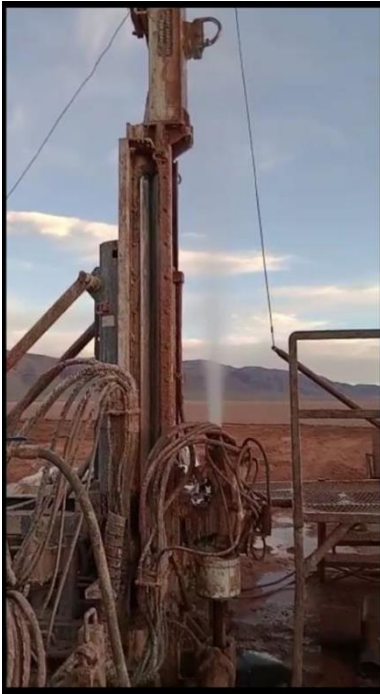
Fig 3. Dec, 2022 Drilling at Pocitos 1