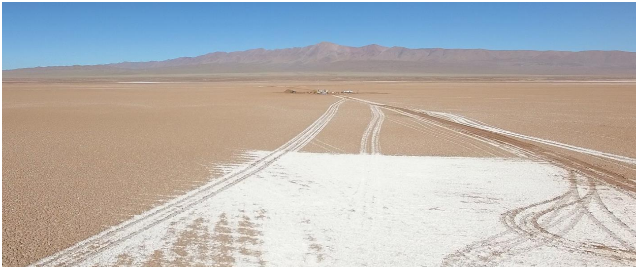
Figure 1. Pocitos 1 Lithium Brine Project Drilling

Vancouver, BC – March 21, 2023 - Recharge Resources Ltd. ("Recharge" or the "Company") (RR: CSE) (RECHF: OTC) (SL5: Frankfurt) announces it has paid USD $500,000, as required by the Company's option to acquire a 100% interest in the Pocitos 1 Lithium Brine project in Salta, Argentina. The amount was paid in advance of the March 21 st 2023 deadline and is the final cash payment required until March 21 st , 2027 in order to acquire a 100% interest in the project and will fully vest the Company as an 80% owner in the project.