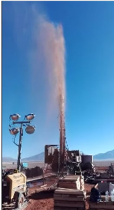
Fig 2. 2018 Drilling at Pocitos 1