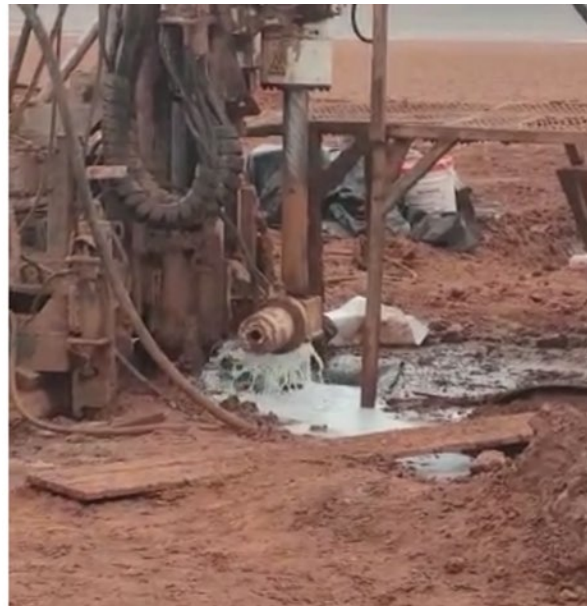
Fig 5. Brine flowing from hole after it intersected aquifer