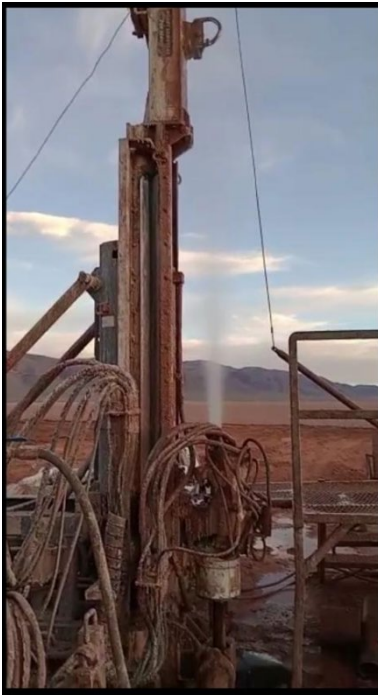
Fig 1. Dec, 2022 Drilling at Pocitos 1

Vancouver, BC – January 24, 2023 - Recharge Resources Ltd. (“Recharge” or the “Company”) (RR: CSE) (RECHF: OTC) (SL5: Frankfurt) is pleased to announce the completion of DDH1 that intercepted the targeted brine aquifers and sampled 169 ppm lithium and flow rates similar to what was previously observed under its own pressure, constrained by a valve to preserve the well. The brines flowed for 10 days. The drill hole also intercepted gas (tested to have minor amounts of carbon dioxide) in a porous lithological unit that accelerated the brine flow.