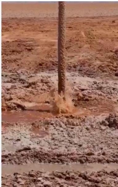
Fig 4. DDH1 brine flow with gas being released

The brines were tested with a blank (distilled water), two duplicates and one standard at 268ppm Li. Another set of samples has been sent to Alex Stewart for testing by the QP, Phil Thomas. Packer testing for brines commenced at the 252M level, with core showing brines, but no flow was recorded. Significant brine flow was recorded at 342m and again at 363m. This is consistent with previous drilling results. The gas intrusion prohibited the drillers going below 363m as they were not able to get the water return.