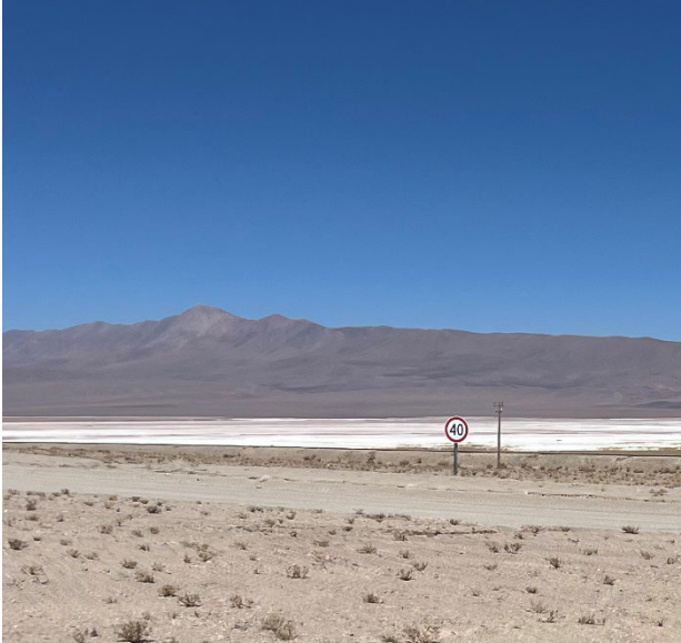
Fig 3. Pocitos Salar with power lines and rail to Antofagasta, Chile Port