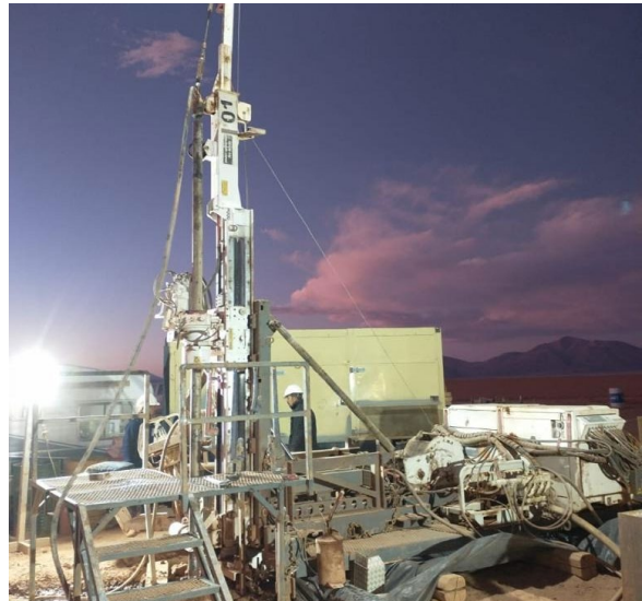
Figure 2. Drilling commences at Pocitos 1