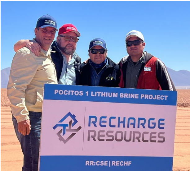
Figure 1. Recharge Resources Team Members and Investors at Drill Pad awaiting drill arrival

This past weekend as planned a steel pipe was cemented down to 50 meters to provide a casing and secure the hole for the HQ diameter drill head. The cementing process took two days to cure with drilling this week passing 100 metres continuing down to Recharge's target production depth of 400 meters. The sedimentary clays encountered thus far has been consistent with the 2018 drilling with the Company anticipating being in the target aquifer zones next week.