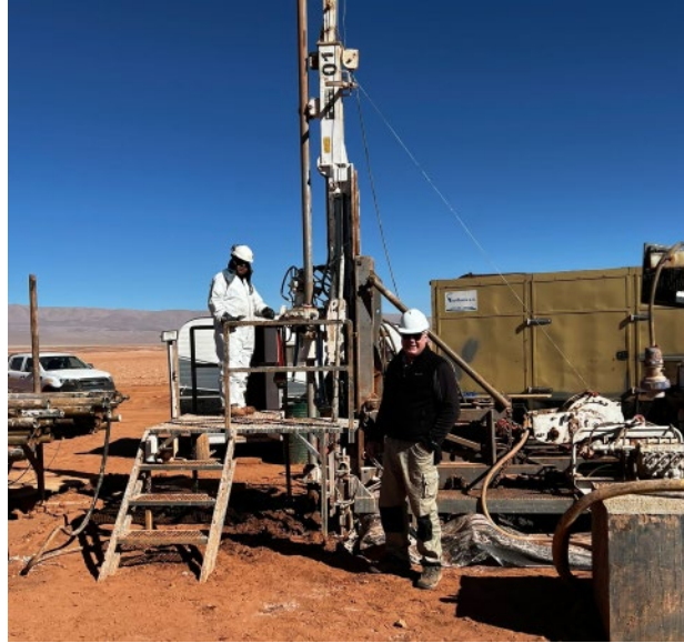
Figure 4. Drilling continues at Pocitos 1 Lithium Brine Project – QP on site

Upon completion of drilling the HQ diameter well, a rotary production rig will ream out the HQ to 20-25cm diameter well. Samples will be sent to two laboratories for QA/QC and 200L to Ekosolve to process and extract the lithium from the brine. During that time, flow testing will take place for 1-5 days and then over a 30 day period.