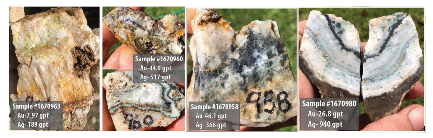
Figure 2. Samples collected at Little Granite Ivanhoe/Emporia Program; Sample correspond to Table 2 below from the Winston Property.

Michael Feinstein, PhD, CPG, QP, visited the Winston Property area on ten separate occasions since October 2020 and spent more than 3 months, cumulatively, on the Property; most recently visited in September 2023.