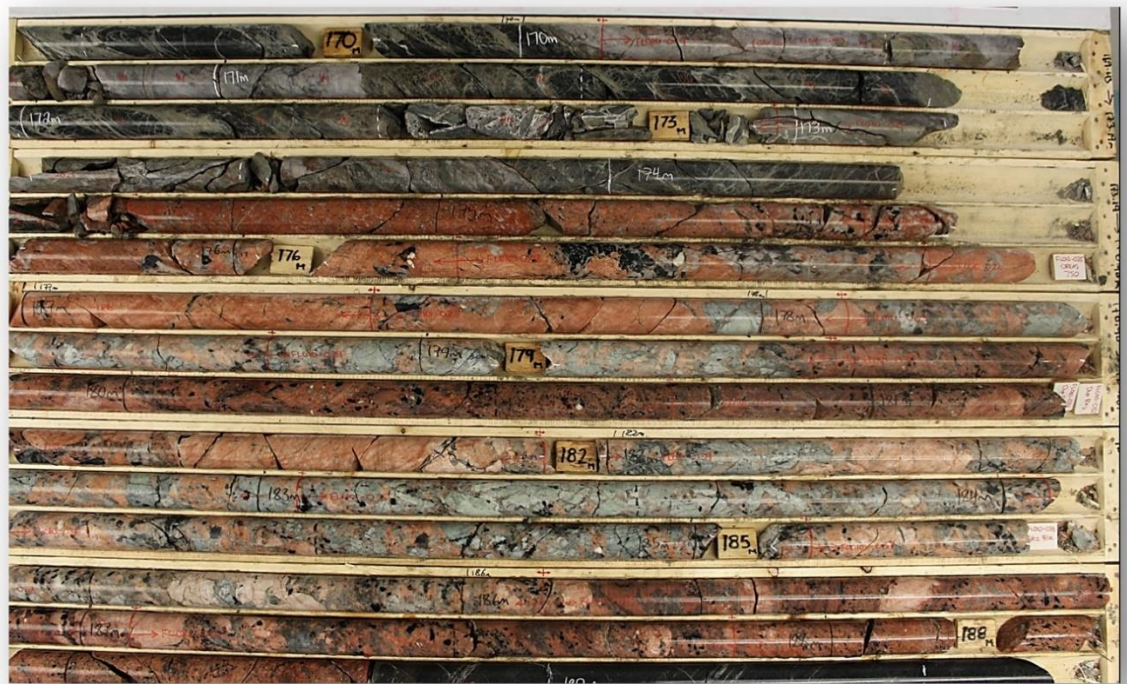
Picture 2 - Drill Core from FL 24-010