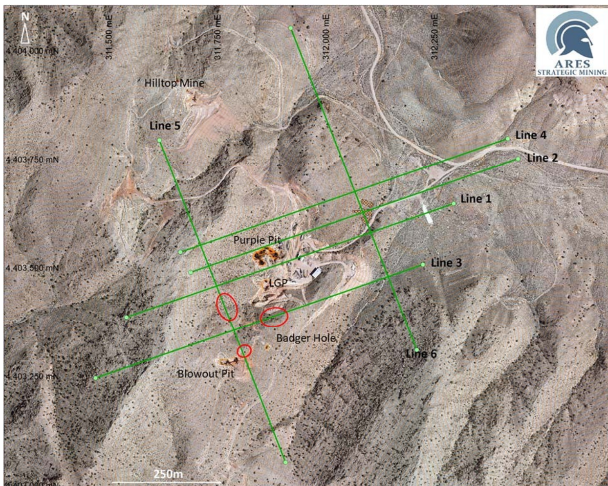
FIGURE 9.1 LOCATION OF IP SECTION LINES, AND POSITION OF THE NEWLY LOCATED POTENTIAL BRECCIA PIPE TARGETS

Notes: Breccia pipe targets = red circled area