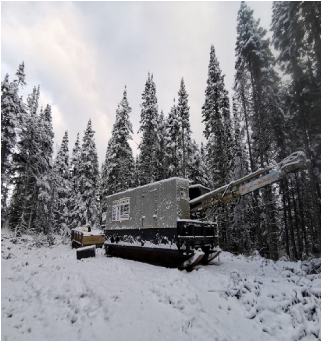
Drill rig on site

To view an enhanced version of this graphic, please visit: