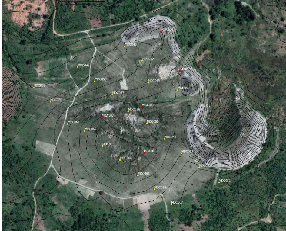
Figure 1. K Dump - Drilled AC (red) and Cobra Holes (yellow)

From the volume estimation report that Tantalex conducted in Q4 2021, the estimated total volume of the K dump is 3 512 532m 3 . With an approximate density of 1,5 g/cm 3 this equals a total estimated volume of 5 268 797 metric tons.