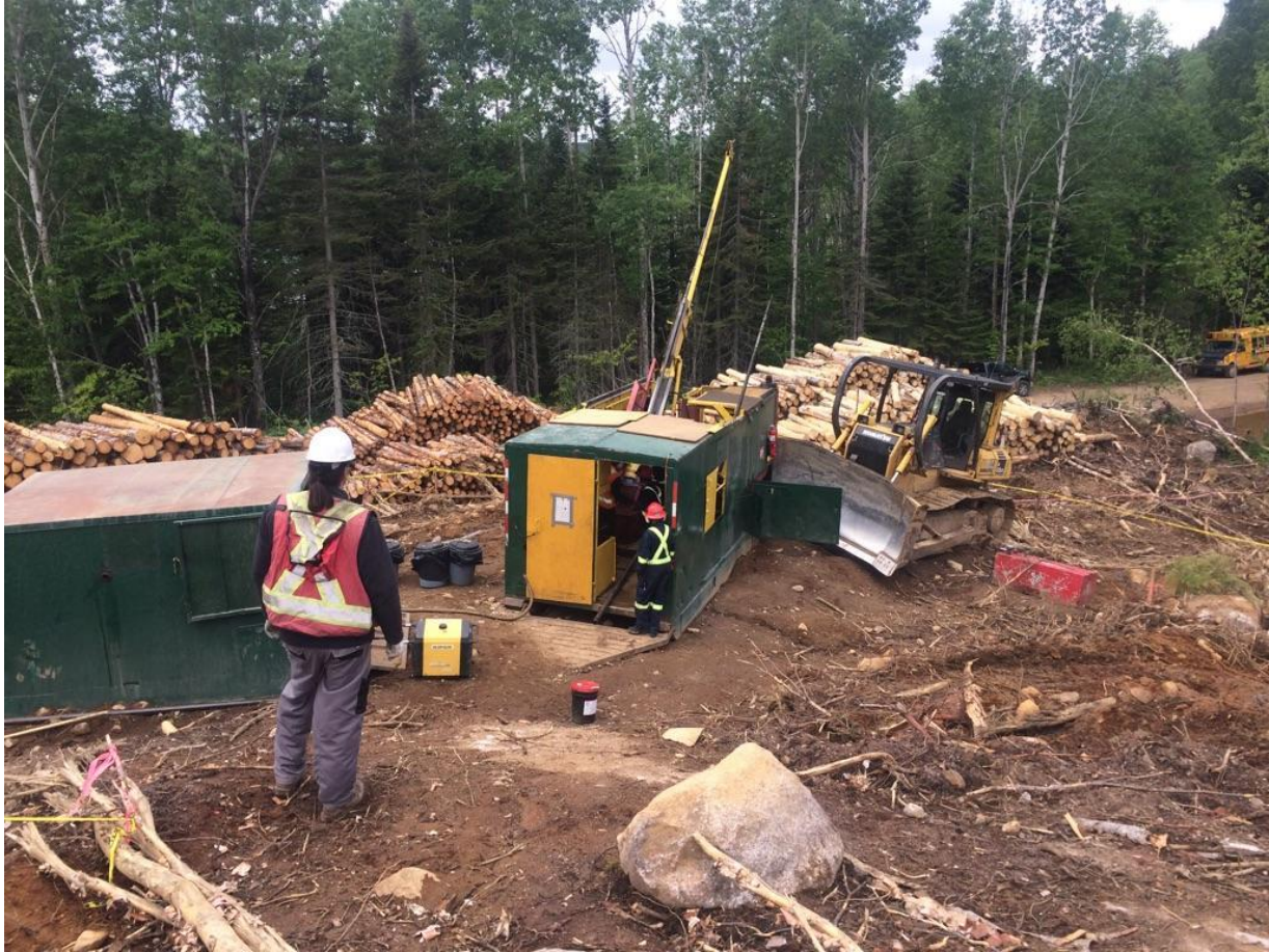
Photo 1 Drill Setup at Zone D