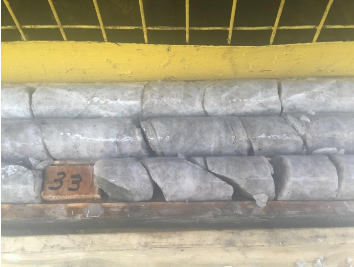
Photo 2 Typical Quartzite in Drillcore at Zone D

Zone E was identified by in outcrops of quartzite approximately 2.3 km north of Zone D and one hole was targeted to test the quartzite at depth. No quartzite was encountered in drilling at Zone E due to less than optimal drill location.