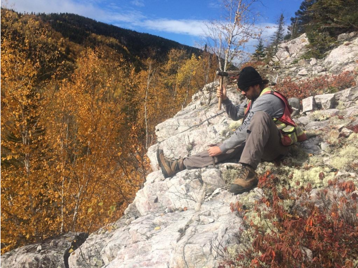
Photo 3 Zone A Outcrop, West Side of Quartzite Ridge