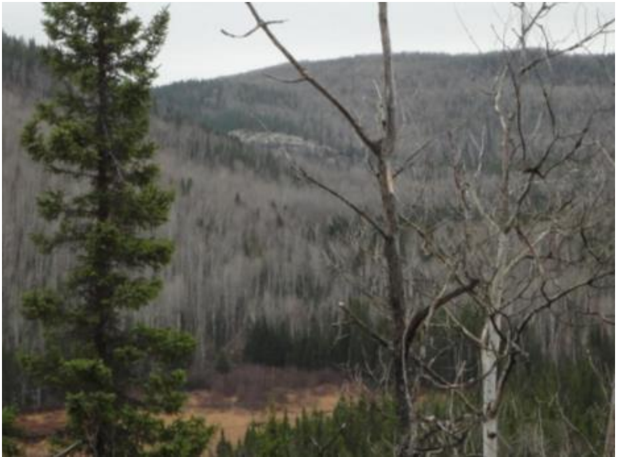
Photo 7 Zone C Outcrop - photo taken from Zone B