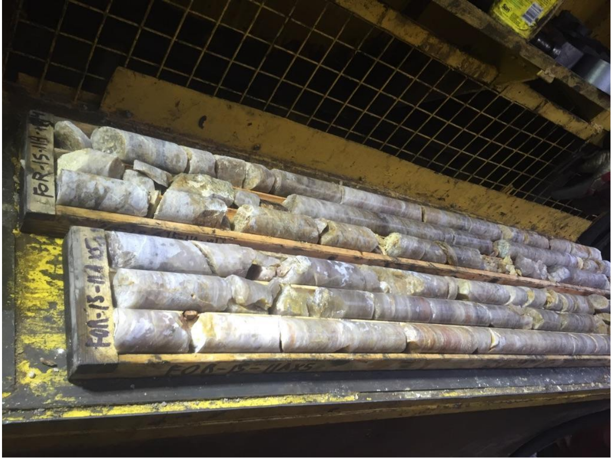
Photo 5 Typical Quartzite from Zone A Drilling