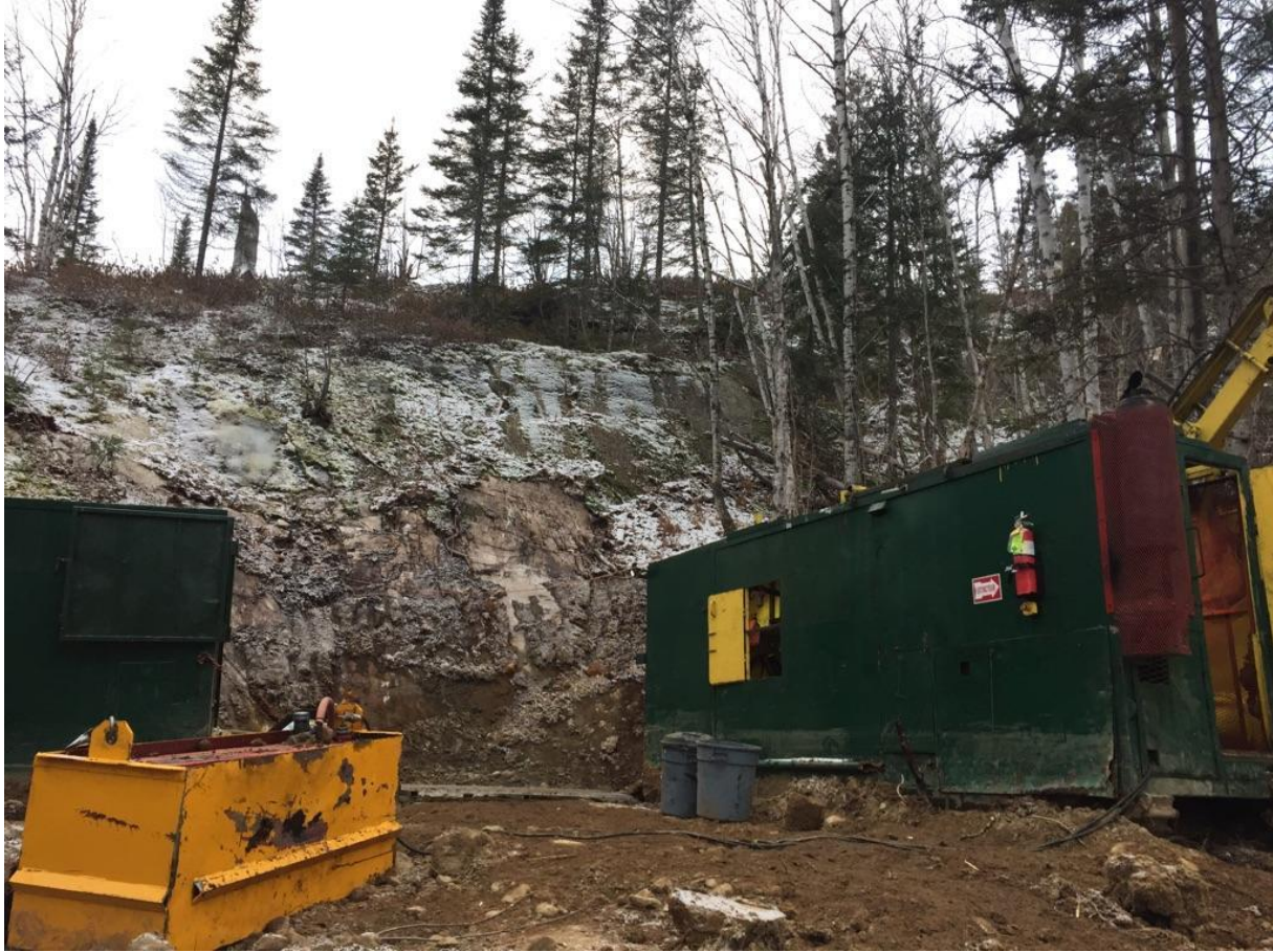
Photo 4 Zone A, Drill Setup, East Side of Quartzite Ridge