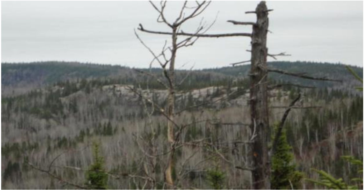
Photo 6 Zone B Outcrop - photo taken from Zone C