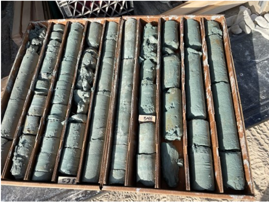
McGee Lithium Clay Project - Hole #15

To view an enhanced version of this graphic, please visit: