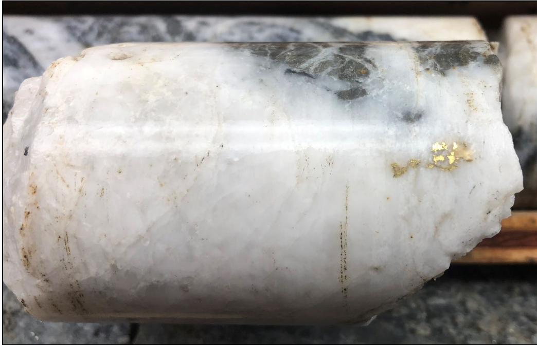
FIGURE 1 – Visible Gold in Drill Intercept I-19-13A (in retained half core)

The Idaho #1 Vein was the most productive and highest-grade vein of the I-M Mine. Historic production from the Idaho #1 Vein is estimated at 935,000 oz of gold with an average head grade of 38.7 gpt (1.12 opt) gold. Total historic production from the Idaho Veins is estimated at 1,621,000 oz of gold with an average head grade of 28.4 gpt (0.74 opt) gold.