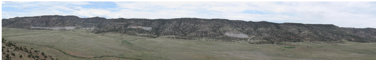
Figure 4.3. Panoramic view of the Gypsum Valley side of the SMC looking southwest from across the Gypsum Valley. Mine dumps from left to right are the Sunday/Carnation, St. Jude and West Sunday. The Topaz mine is out of sight on the far right, tucked into a drainage ditch.