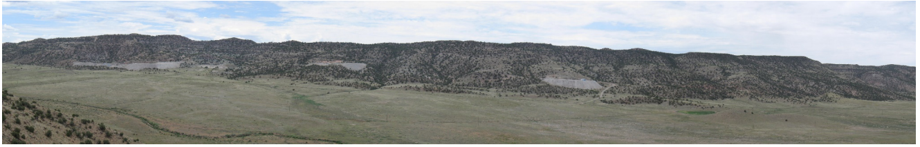
Figure 4.3. Panoramic view of the Gypsum Valley side of the SMC looking southwest from across the Gypsum Valley. Mine dumps from left to right are the Sunday/Carnation, St. Jude and West Sunday. The Topaz mine is out of sight on the far right, tucked into a drainage ditch.