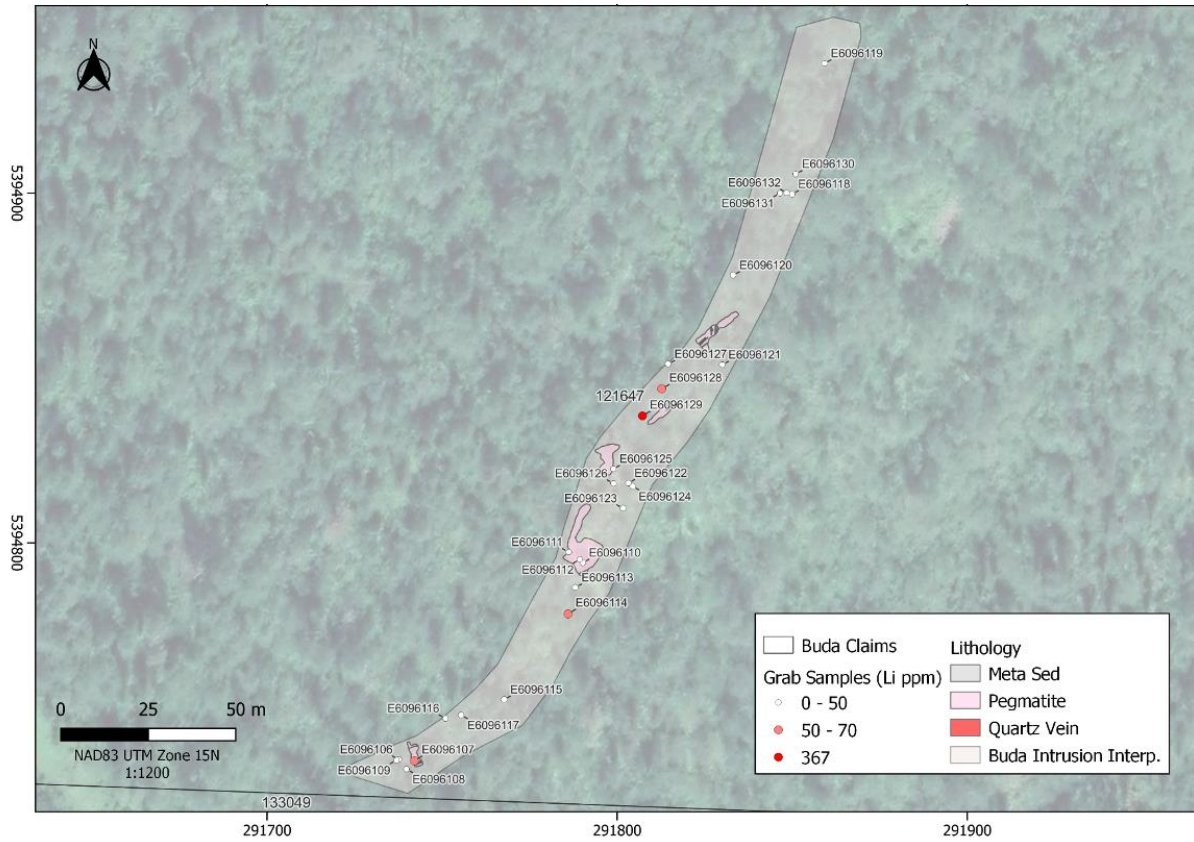
Figure 1: Grab Sample Map (Li)

The Company has received exploration permits from the Ontario Ministry of Mines and intends to commence a diamond drill program immediately (“ Winter Drill Program ”) to test pegmatite layers perpendicular to outcrop zones. The Company anticipates having pre-drill surveying of roads, trails and pads completed by November 30, 2022, with mobilisation of drill equipment following immediately thereafter.