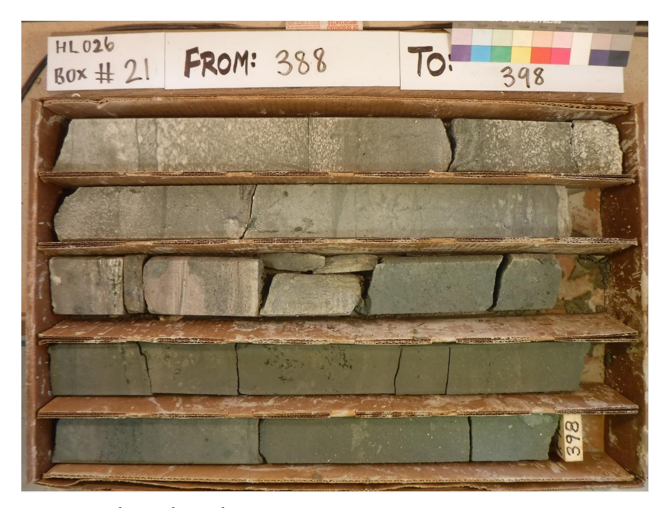
Figure 3 – HL026 from 388 ft to 398 ft