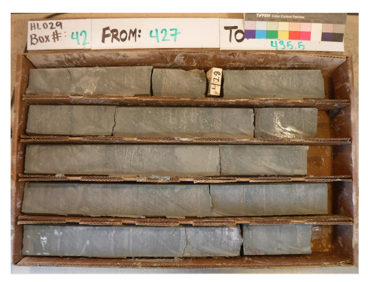
Figure 4 – HL029 from 427 ft to 435.5 ft