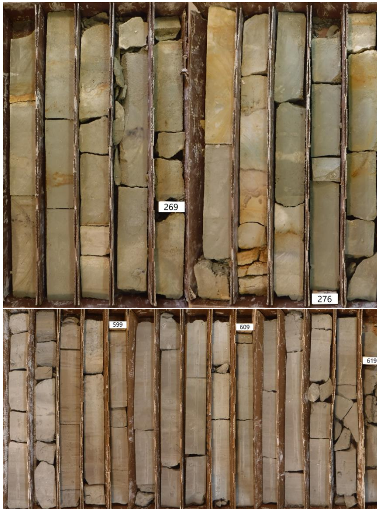
Figure 2 - Core for Drill Hole HL010