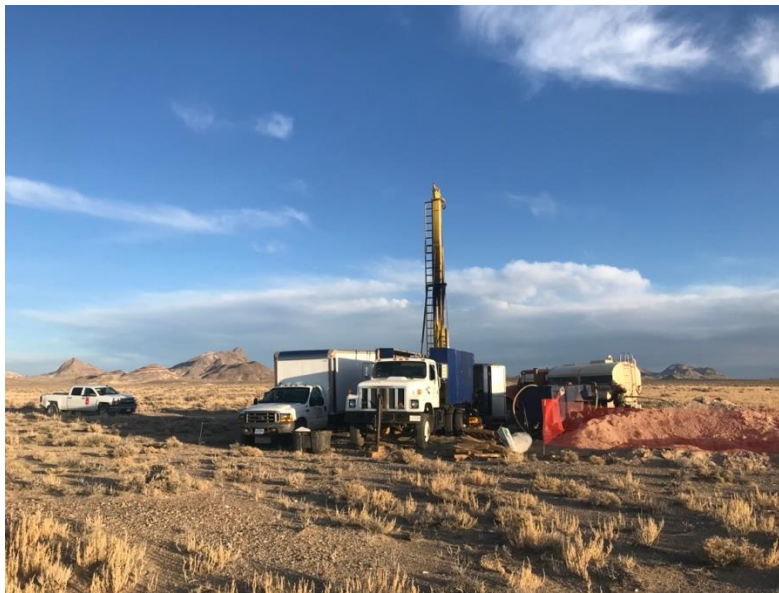
Figure 1 – Drill Rig on Site at the Horizon Lithium Project

Calgary AB – Pan American Energy Corp. (the “Company” or “Pan American”) (CSE: PNRG) (OTC PINK: PAANF) (FRA: SS6) is pleased to announce the Company and its partners, KB Drilling (“KB”) and RESPEC Consulting Inc. (“RESPEC”) has begun drilling at the Phase 1 exploration drill program at its 17,334 acres Horizon Lithium Project (“Horizon”) located in Esmeralda County that is 7.4 miles west from Tonopah, Nevada. The Company will focus immediate efforts on eleven (11) priority drill holes of the fully permitted twenty-two (22) core drill hole program. The Company has detailed an execution plan sequence for the eleven (11) priority drill holes (Table 1).