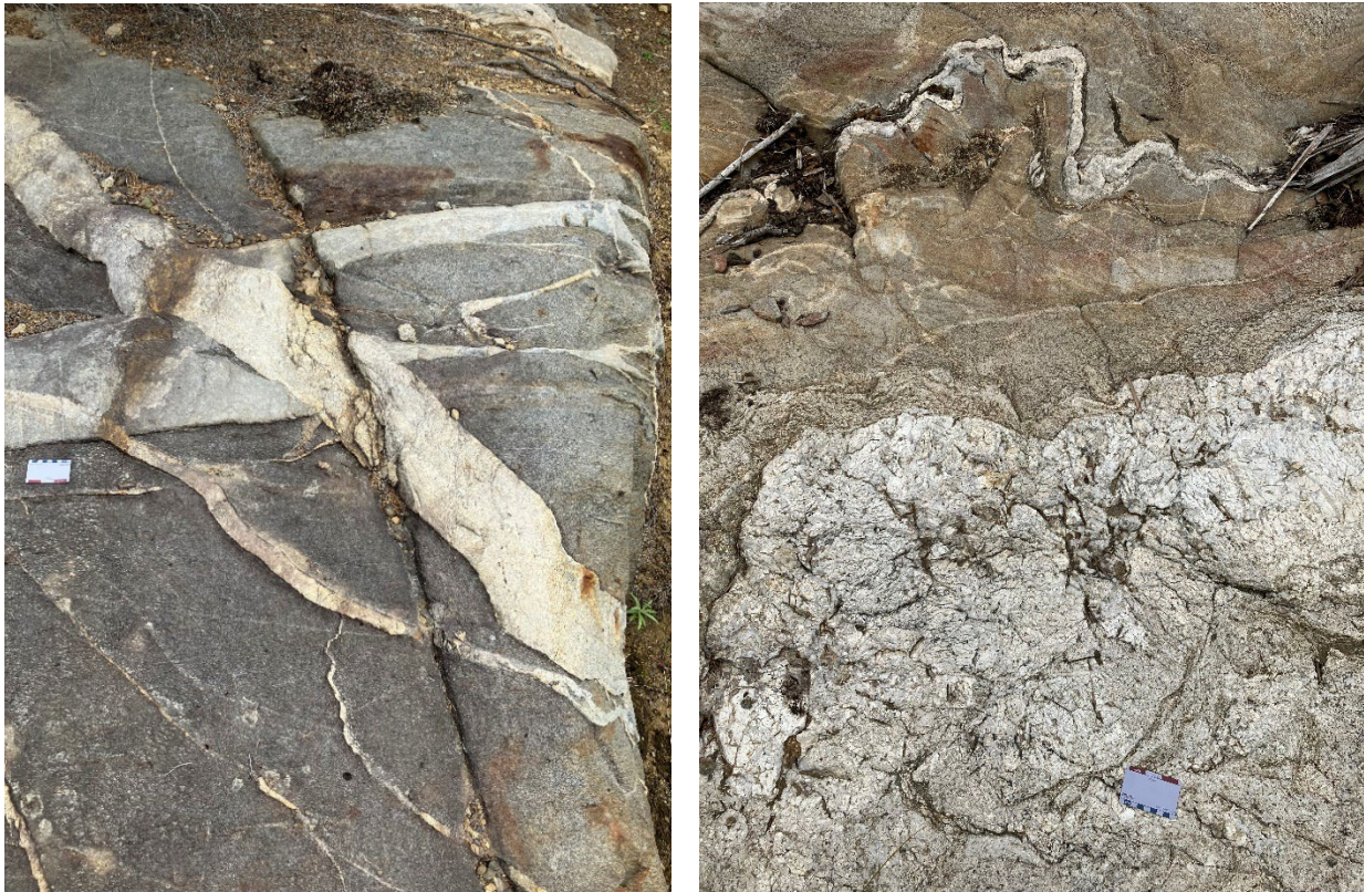
Figure 1. Exposure outcrops in the recommended exploration area. Contact between metasedimentary rocks and white pegmatite. Lidstone Project, Thunder Bay Mining Division, Northwestern Ontario.