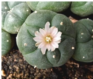
Peyote (Lophophora williamsii)

Mescaline is also the main alkaloid of the San Pedro cactus ( Echinopsis pachanoi , syn. Trichocereus pachanoi ), which is used in the hallucinogenic drink "cimora". In a screening for cactus alkaloids, several other Trichocereus species were found to contain mescaline. Mescaline is typically found in other Trichocereus species including Echinopsis peruviana (Peruvian torch cactus) and Echinopsis lageniformis (Bolivian torch cactus). San Pedro is often the term/name used to describe both Echinopsis pachanoi and Echinopsis peruviana . To date, mescaline from Echinopsis is the longest used psychedelic world-wide with fossil records dating usage back to 5,700 years BC 10 . Mescaline is also found in certain members of the Fabaceae bean family including Acacia berlandieri .