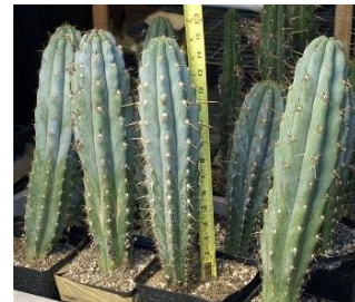
Bolivian Torch (Echinopsis lageniformis)

Mescaline is a controlled substance across North America, which poses some significant challenges to the marketing of a whole plant extract from San Pedro or other mescaline-containing cacti in either the United States or Canada. In Canada, peyote may be sold as whole plant parts. Although exemptions exist in both countries 11,12 for the possession, sale, and use of peyote, these were implemented to permit the religious freedom of the NAC and do not allow for marketing an extract of peyote or other mescaline - containing cacti as a dietary supplement, NHP or conventional food. Such a product would require that mescaline be de-scheduled, safety demonstrated through toxicology studies, and marketing claims proven through scientific investigation in a clinical trial to be appropriate for use in those contexts. Peyote and the other mescaline cacti contain a cocktail of alkaloids that may provide health benefits in the context of a dietary supplement or natural health product.