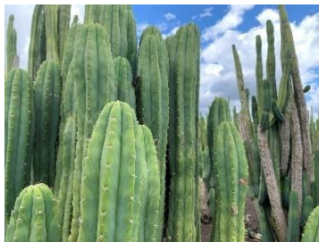
San Pedro (Echinopsis pachanoi)