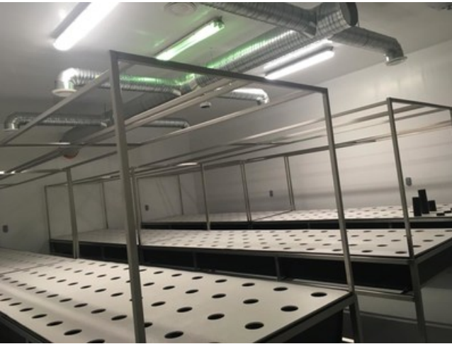
Just Kush grow room #1 - proprietary aeroponic tables in place