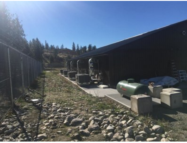
Just Kush facility - brand new HVAC system...done!