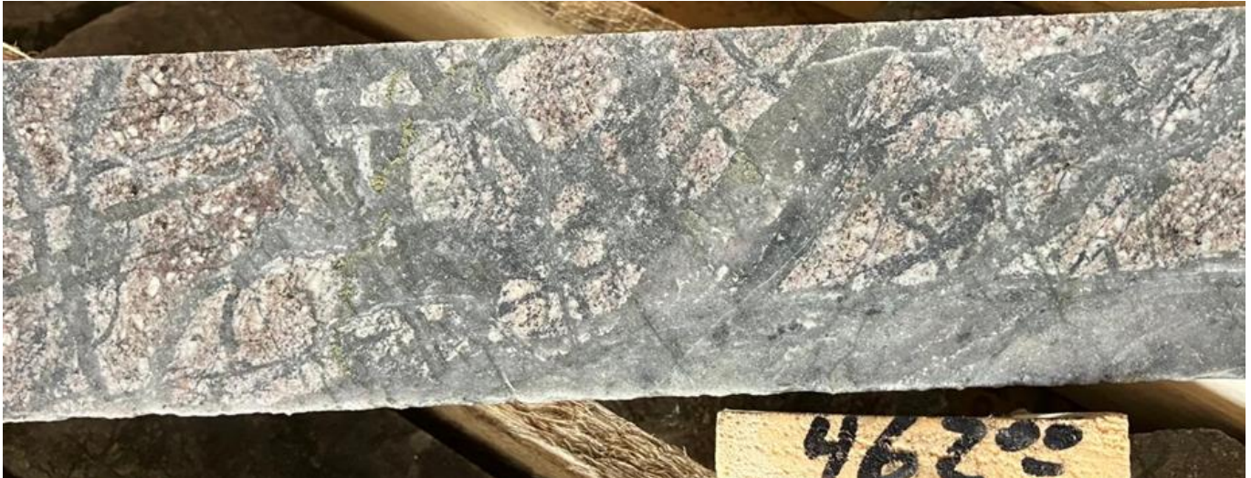
Image 3: Intense porphyry A type quartz stockwork with strong disseminated chalcopyrite mineralization, overprinting intermineral potassic altered porphyry