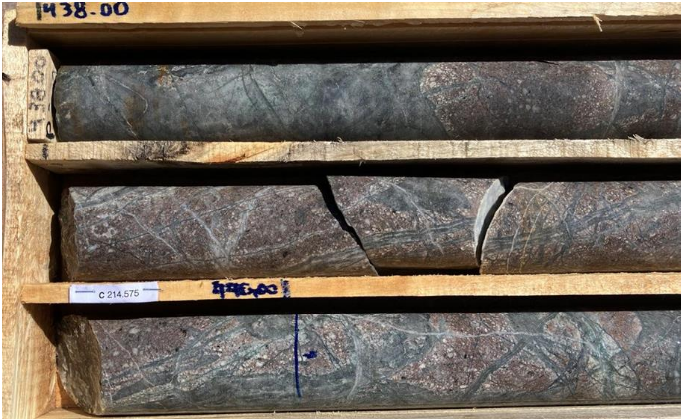
Image 2: Intense porphyry A type quartz vein stockwork with disseminated chalcopyrite and bornite, overprinting early potassic altered diorite porphyry

A significant increase in quartz veining is observed from 364 m downhole, coincident with an increase in intermineral potassic alteration (Kfeldspar-quartz), higher magnetite content, lower presence of early biotite and the appearance of bornite and chalcopyrite mineralization. Bornite mineralization remains evident down to 610 m, often more abundant than chalcopyrite, and coincident with an increased intensity of porphyry A type quartz veining and pulses of intermineral granodiorite porphyry. Bornite is disseminated in quartz veinlets, frequently intergrown with chalcopyrite. The bornite mineralized core remains open to depth.