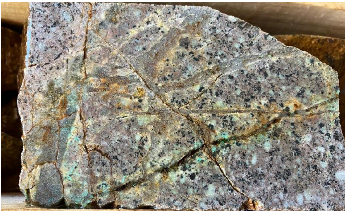
Image 1: Porphyry A type quartz stockwork veining with potassic (K-Spar) altered vein halos, supergene Cu enrichment and Cu oxides overprinting potassic altered quartz-diorite porphyry (218m)

Moderate intensity porphyry A type quartz veinlets were intersected from 120 m downhole, with copper oxides evident between 218-232 m, partially coincident with a zone of moderate supergene copper enrichment from 226 to 380 m. Copper sulphide (chalcopyrite) mineralization is evident in quartz veining from 270 m.