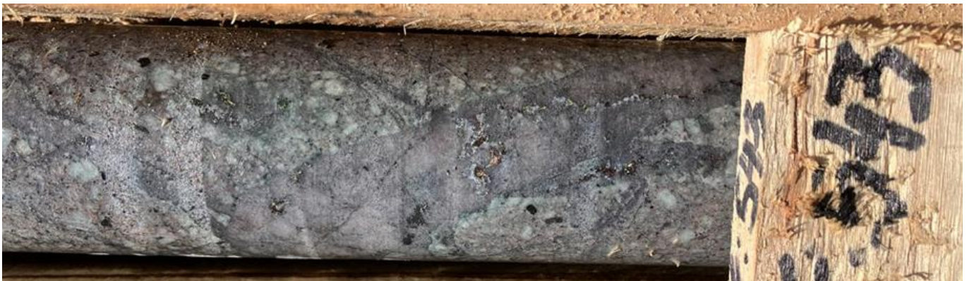
Image 4: Porphyry A type quartz vein hosting coarse bornite mineralization, overprinting intermineral potassic altered porphyry

Assays have been prepared and dispatched to the ALS laboratory in Mendoza, results expected shortly.