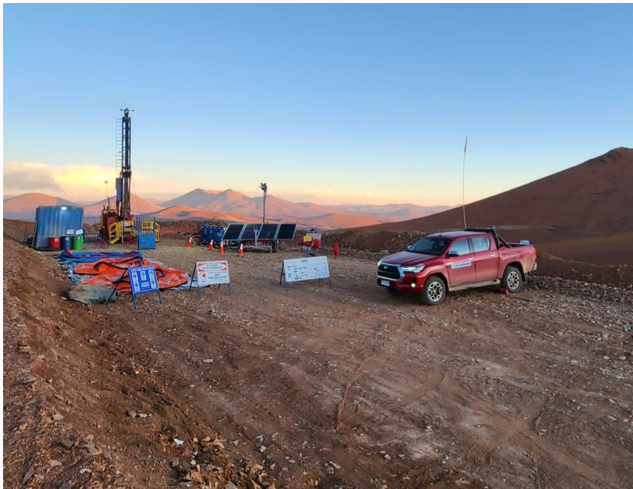
Buenavista Target – Block 4 – Drill Rig on Site for First Drill Hole