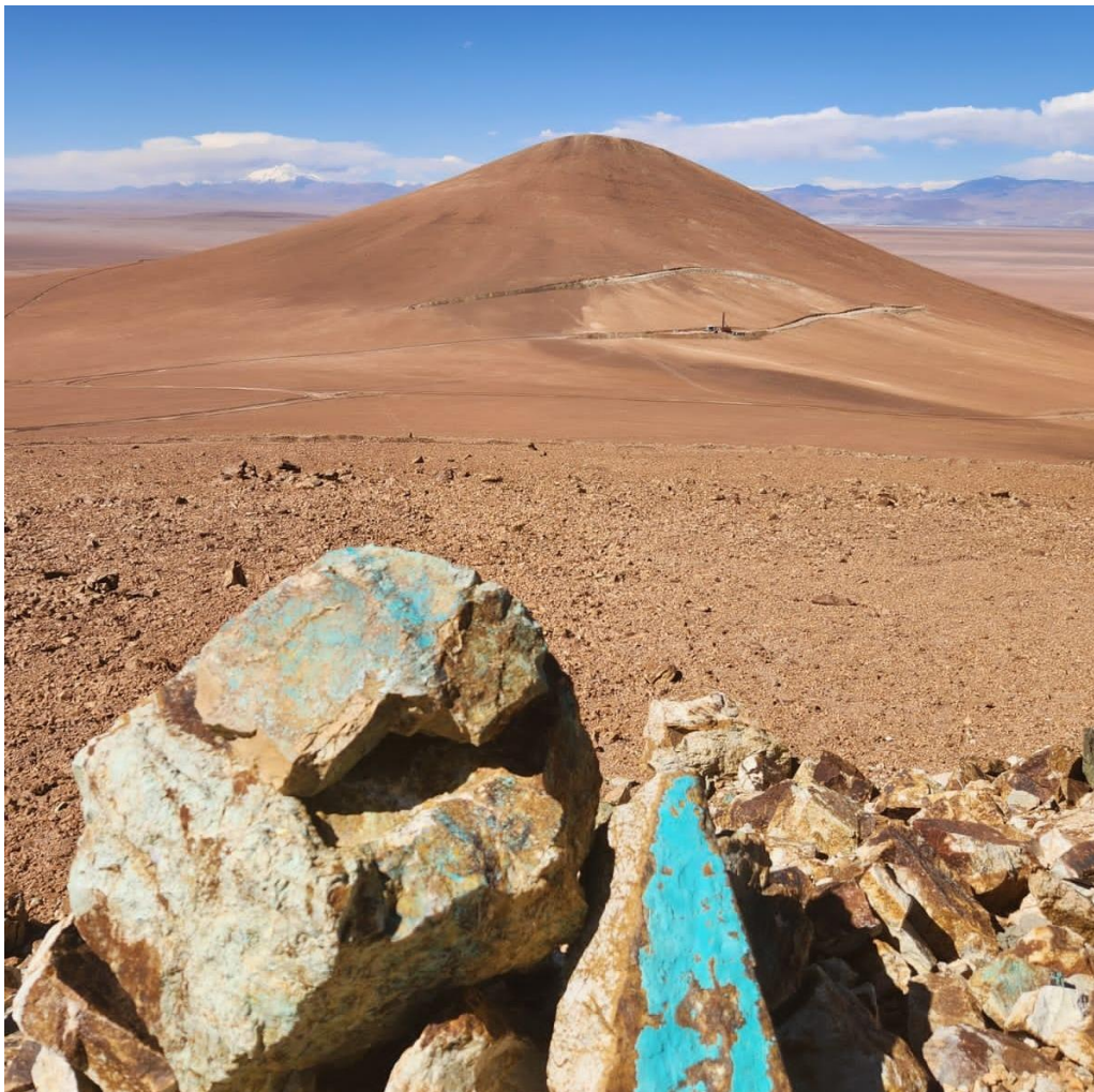
Buenavista Target – Block 4 – Drill Rig on Site (light coloured area) for First Drill Hole

The first drill hole is centred on the dacite porphyry and phreatomagmatic breccia complex with quartz-veinlet stockworking at Buenavista, and is initially targeted to a depth of about 750m. The drill hole diameter will be HQ, with the option of reducing to NQ at depth, depending on drilling conditions.