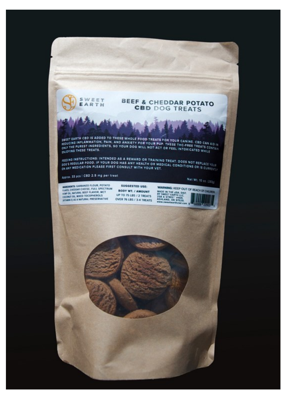
Figure 1: Sweet Earth's Beef & Cheddar Potato CDB Dog Treats

Sweet Earth is a complete vertically integrated "farm to shelf" company that is a member of the US Hemp Association and is Leaping Bunny Certified, while Mota is a direct to consumer provider of a wide range of CBD products in the United States and Europe. The two companies (the " Partners ") expect to sell Sweet Earth's award-winning products, beginning with CBD dog treats and paw and nose balm, through Mota's consumer brand, Nature's Exclusive, which is sold in the United States. Mota has initially selected Sweet Earth's popular Beef and Cheddar Potato CDB Dog Treats to be sold under the Nature's Exclusive brand.