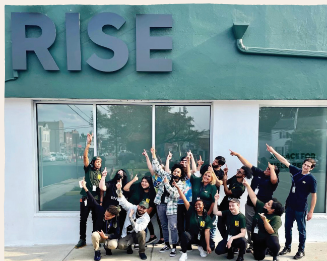
Opening of RISE Bloomfield in New Jersey on September 15, 2021.

Hiring or supervising family members or a person with whom you have a close personal or romantic relationship.