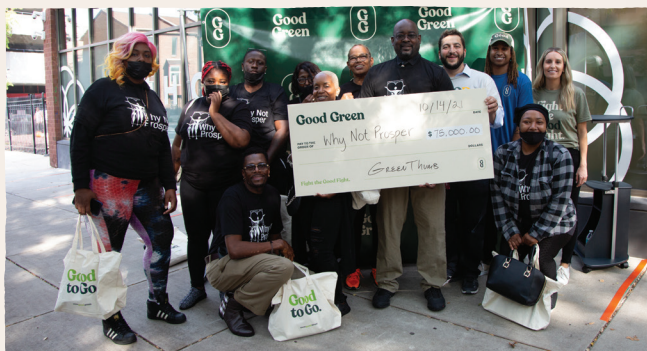
2021 Good Green Grant recipient "Why Not Prosper" in Philadelphia, PA.

Because violations of this Code may damage Green Thumb's reputation, or even be illegal, Green Thumb reserves the right to discipline any personnel who violate this Code, including possible termination of employment.