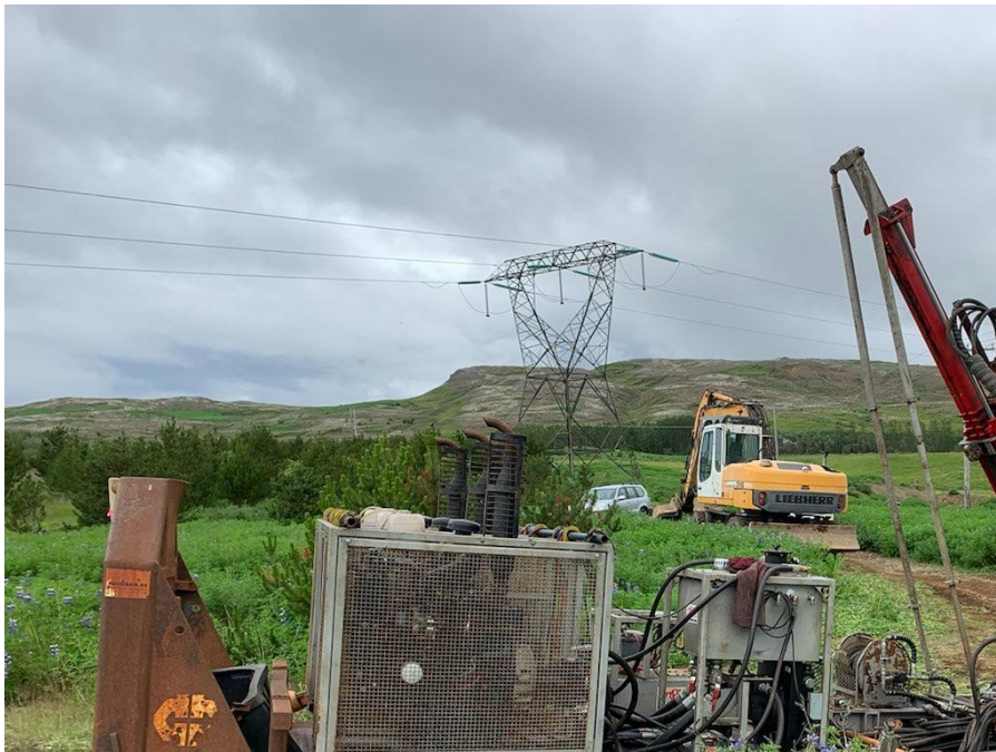
Picture 1. Drill Rig on Thor Gold Project

The first of 22 planned drill holes ranging from 125 to 500 meters in depth is underway on the Thor Gold Project in Iceland. Drilling targets will allow for twin drilling some of the historical holes to allow a NI 43-101 resource estimate and for future definition of the gold deposit. This campaign is fully funded and should stretch over the next 3 months for a total of 4,060 meters.