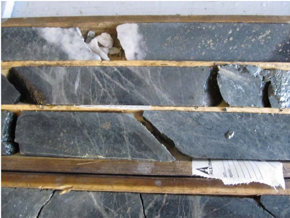
Figure 2. Picture of a section of Hole FV-11-07. Pyrite / pyrrhotite in andesite / basalt