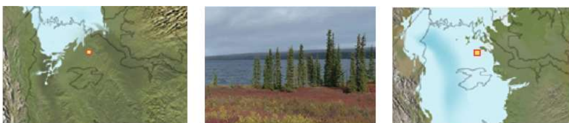
45 Ma Tertiary (after Blakey 2010)

We know that the Cretaceous sea twice covered the area and an arm of the Tertiary sea reached ~50 km NNW of Seahorse Lake (figure 1). Tropical weathering occurred in the Eocene (55 Ma) so that marine sediments with foraminifera lying above the Eocene weathering must be Tertiary.