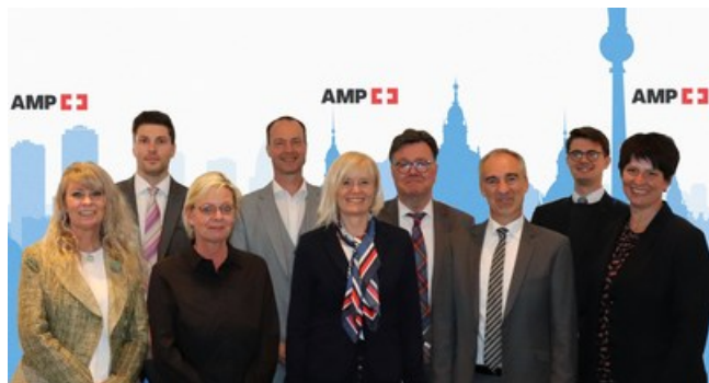
AMP's Sales Team Group Picture

AMP's nationwide sales team includes highly capable and accomplished pharmaceutical sales representatives in Stade, Cologne, Nordhausen and Speyer who are selling Aphria and AMP's catalogue of medical cannabis products to over 13,000 pharmacies under AMP's co-promotion agreement with CC Pharma , a national pharmaceutical distributor and a wholly-owned subsidiary of Aphria Inc. (Nasdaq: APHA ).