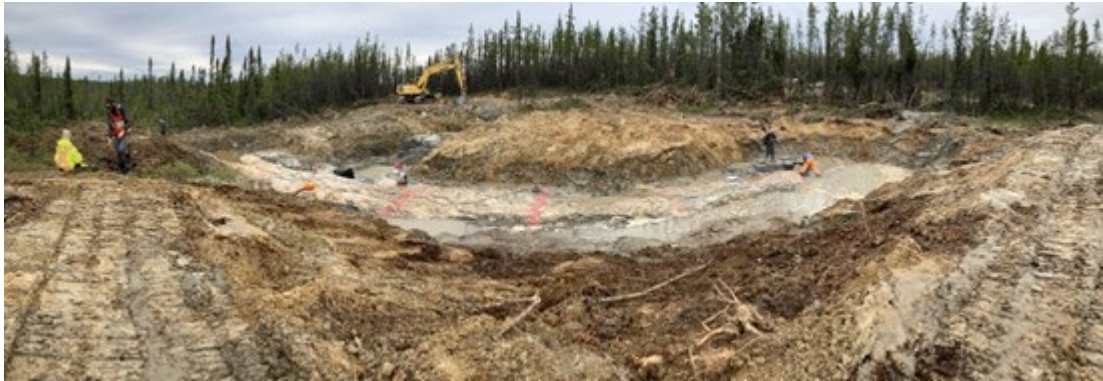
Fig. 3 Trench #10, view to NNW at center of panoramic image. Overview of 40 m long strike exposure of approx. 3.5 m wide spodumene-bearing pegmatite dike. Channel sample diamond sawing in progress at east end.

https://images.newsfilecorp.com/files/8681/216607_32a40a17f4dc3927_002full.jpg