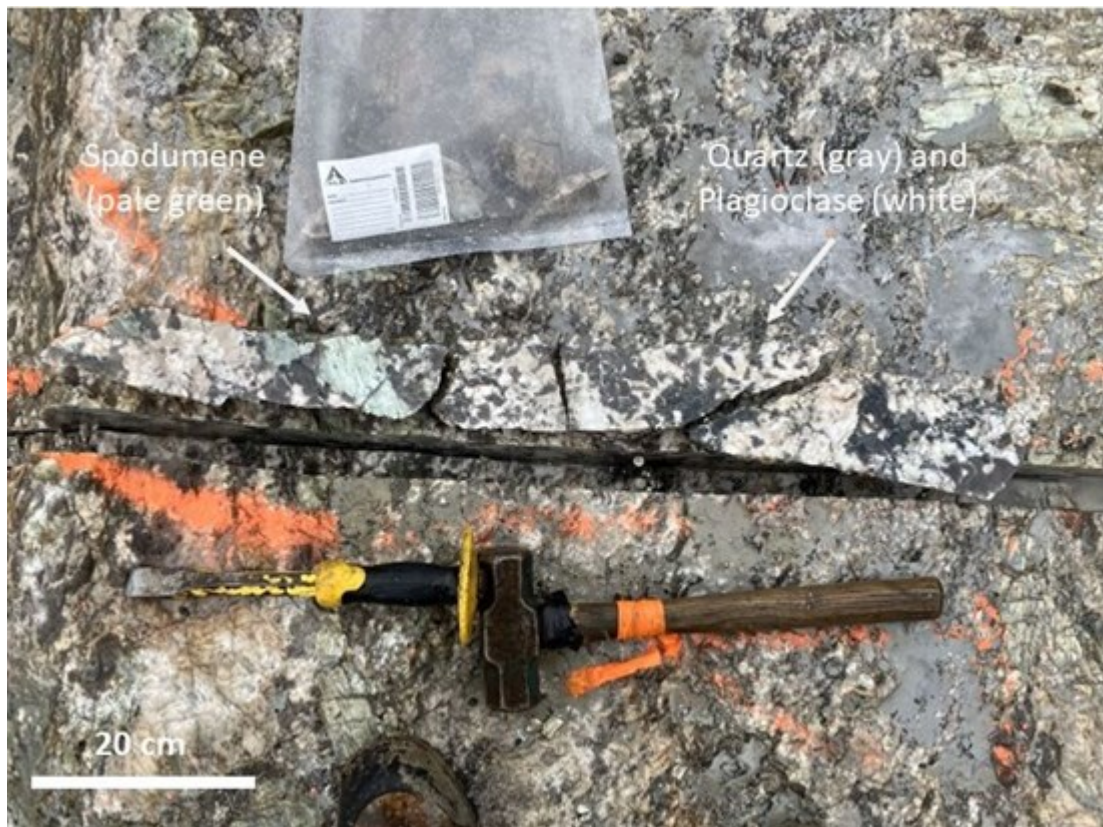
Fig. 4 Trench #10. Detail of assembled channel pieces from sample F686585 at southern margin of spodumene-bearing pegmatite dike.

https://images.newsfilecorp.com/files/8681/216607_32a40a17f4dc3927_003full.jpg