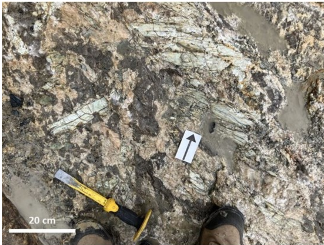
Fig. 5 Trench #10. Detail of concentration of spodumene crystals near eastern limit of trench exposure.

To view an enhanced version of this graphic, please visit: