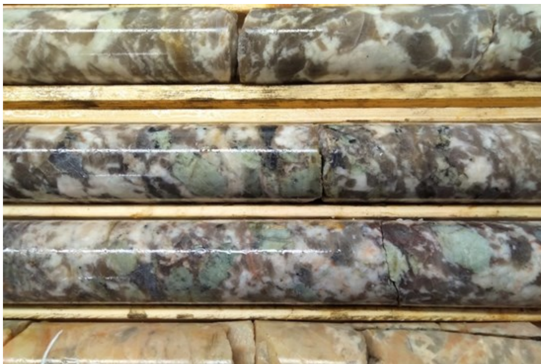
Figure 1: Core boxes containing spodumene-bearing pegmatite in hole EIQ24-007

Champion Electric's drill program successfully completed 10 diamond drill holes totalling 2,263 metres. Drill hole EIQ24-007 intersected a span of approximately 18.8 m of spodumene-rich pegmatite, stretching from 7.30 m to 26.10 m downhole. This mineralized zone was found underneath 6 m of overburden (see Figure 1)*. Drill hole EIQ24-008 also intersected spodumene-rich pegmatite over 5.90 m from 16.15 m to 22.05 m downhole. The mineralization consists of light green coloured spodumene. The presence of spodumene was confirmed by LIBS readings ** .