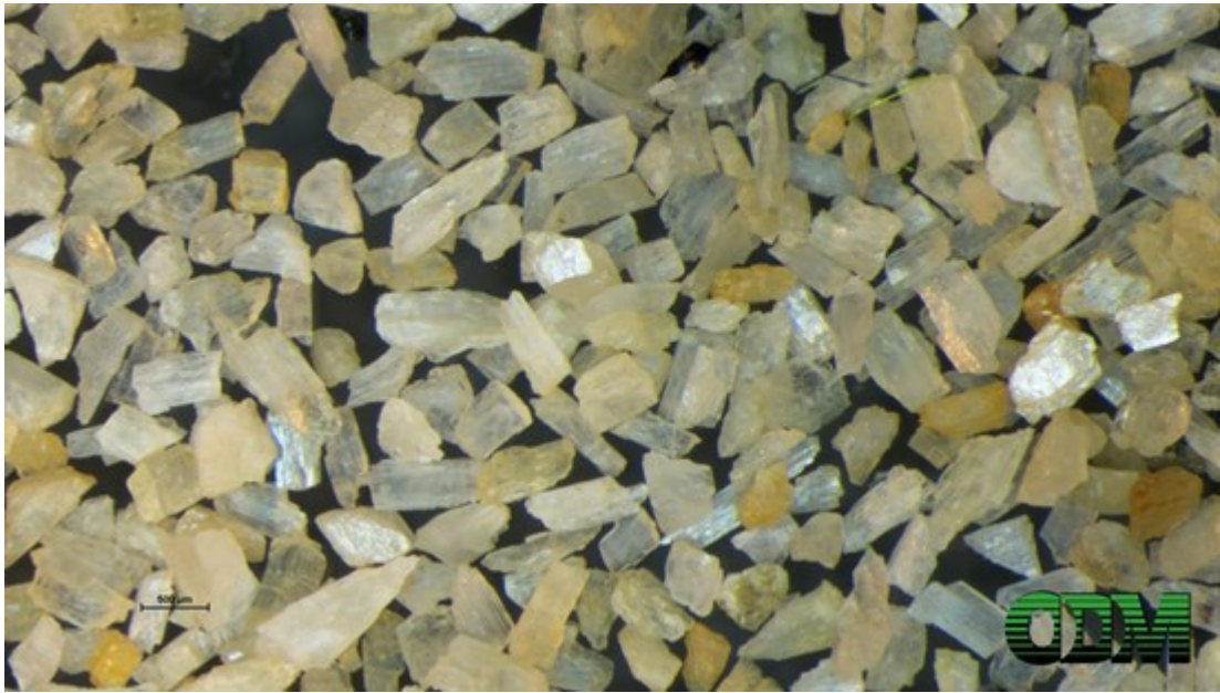
Figure 3: Grains of spodumene in till sample fraction 0.25 - 0.50mm from the Western prospect

To view an enhanced version of this graphic, please visit: