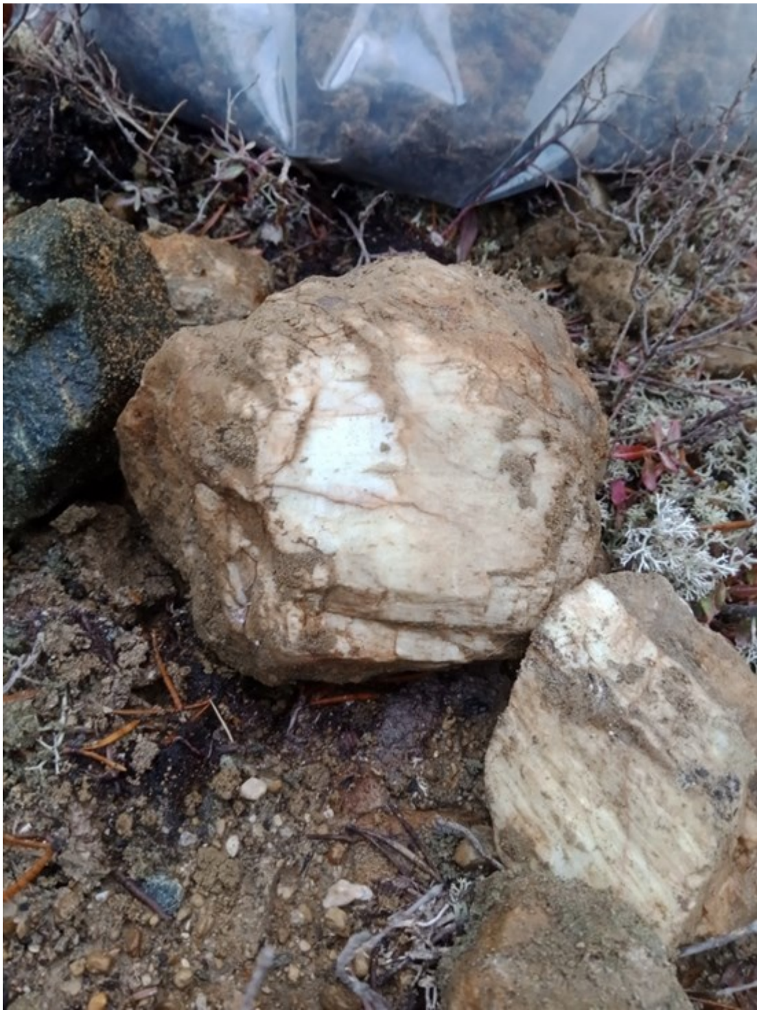
Figure 4: Fist-sized angular spodumene boulders retrieved from a till sample at the Western prospect

To view an enhanced version of this graphic, please visit: