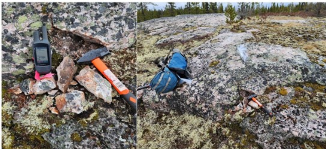
Figure 2: Pegmatite outcrops at the Des Bois Lithium Project

To view an enhanced version of this graphic, please visit: https://images.newsfilecorp.com/files/8681/163390_img2.jpg