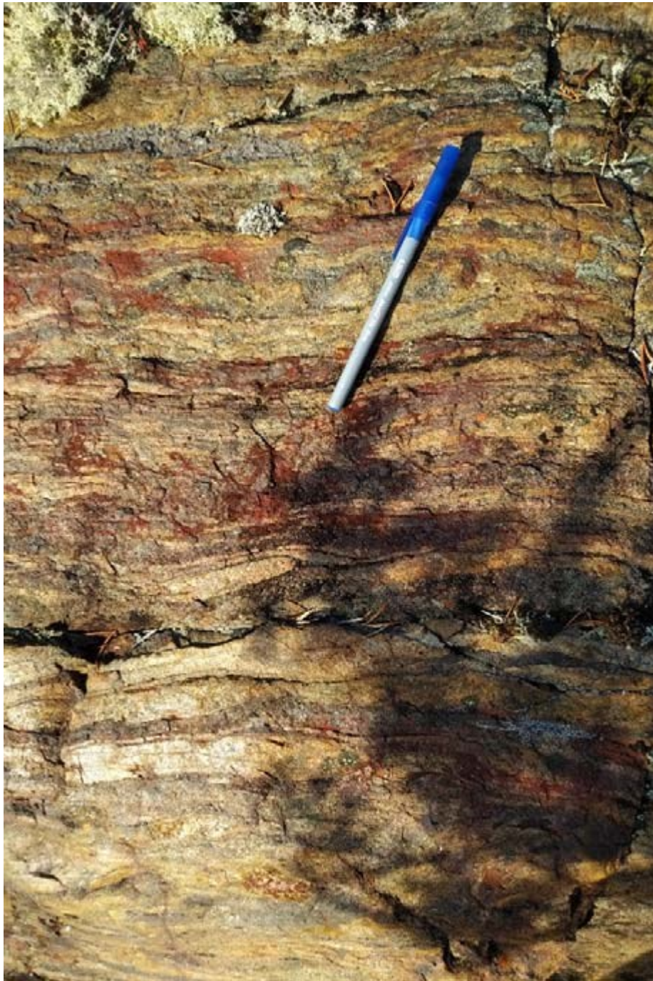
Figure 2 - Banded iron formation

To view an enhanced version of Figure 2, please visit: