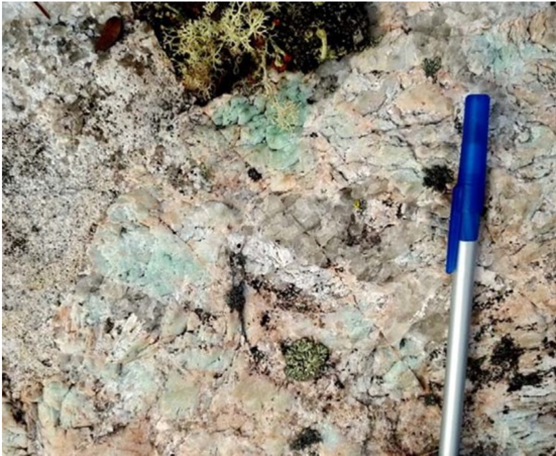
Figure 1 - Blue-green feldspar in pegmatite

To view an enhanced version of Figure 1, please visit: