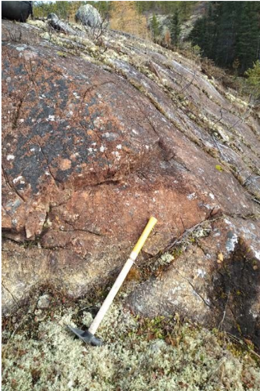
Figure 3 - Ultramafic rocks

To view an enhanced version of Figure 3, please visit: