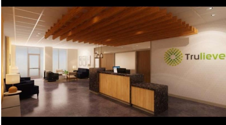
Trulieve lobby and waiting area