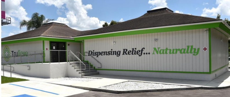
Exterior of Trulieve location in Tampa, FL

and pricing. Patient consultants are available to answer questions about the products and pull products for patients for sale. Point of Sale systems tie into the state registry to seamlessly complete transactions. Each store is designed for high throughput. On the highest single sales day to date approximately 4,180 patients were served in 17 open locations. On average, approximately 2,084 patients are served in Trulieve stores daily. In 2018, to date, Trulieve has served 91,928 unique patients both in-store and via home delivery.