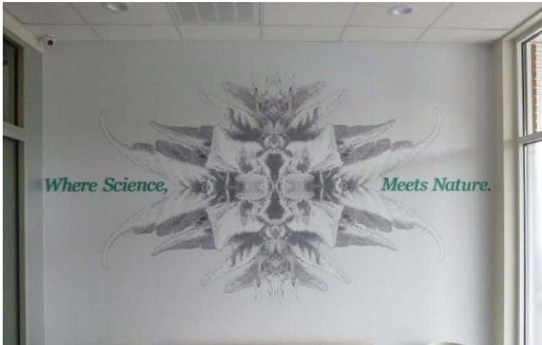
Trulieve private consultation room graphic