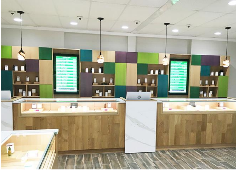
Trulieve Dispensary showrooms