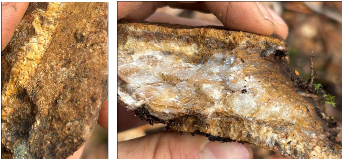
Figure 1 (left): Specimen of a carbonate-quartz-pyrite vein in altered andesitic volcanoclastics on the Washburn Lateral, in a sample returning 1.27 g/t Au. Figure 2 (right): Specimen of a characteristic two-phased quartz-carbonate-pyrite vein, containing a coarse crystalline carbonate margin and inner quartz component, recognized to host gold (including visible gold) in the Halo and North Hixon zones.

Golden Cariboo’s President and CEO, Frank Callaghan, stated “This year’s field campaign was highly successful in extending the surface footprint of our multi-kilometer gold system. These results further suggest that significant potential remains on the Property yet to be tested with the drill bit, including the southeastern extension of the North Hixon zone which remains a high priority target for the Company.”