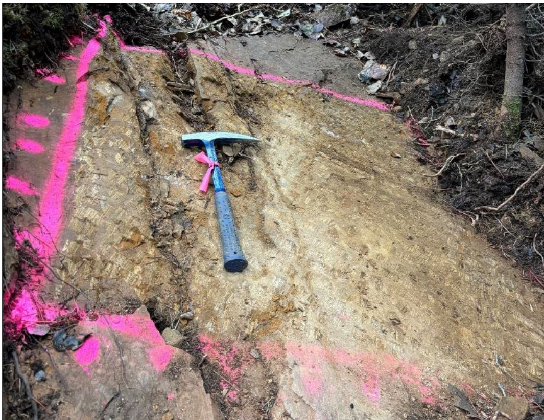
Figure 4: Panel sample in the Halo zone which returned 5.15 g/t Au over a 1 x 1 m area