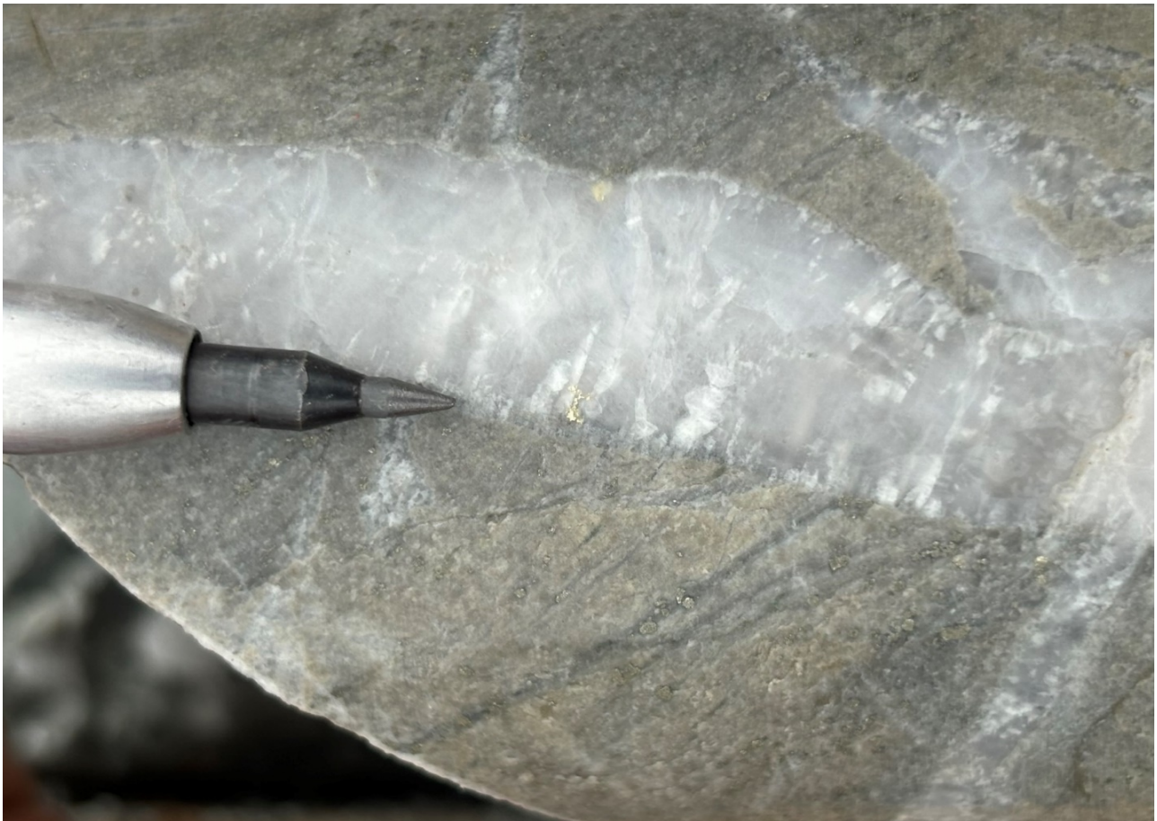
Figure 1: Example of visible gold observed in drill hole QGQ24-19 at a depth of 59.03 m (199.67 ft)

Golden Cariboo’s President and CEO, Frank Callaghan stated “Our technical team has seen extensive quartz veining including visible gold in all four of the recent drill holes. We’re getting a grasp on the geometry of the system and systematically exploring the large gold-bearing trends. We see extraordinary prospectivity along these trends and are currently pushing to expand the Halo zone, open in all directions, to the north with drill hole QGQ24-19. This drilling has intersected prospective veining, extensive alteration plus visible gold within the veins. Early signs point to a robust gold system with bulk-tonnage mining potential, starting from surface.”