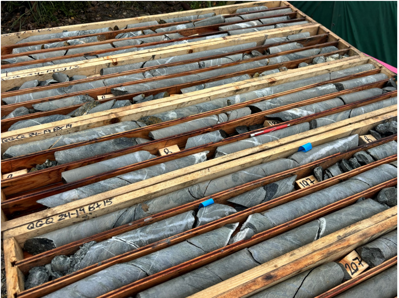
Figure 2: Example of sheeted to stockwork veining in drill hole QGQ24-19