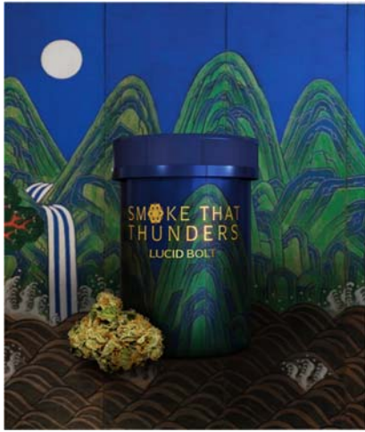
BC Indoor Lucid Bolt

For the Nine Months Ended April 30, 2023 and 2022