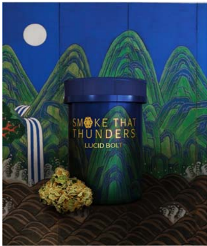
BC Indoor Lucid Bolt

For the Six Months Ended January 31, 2023 and 2022