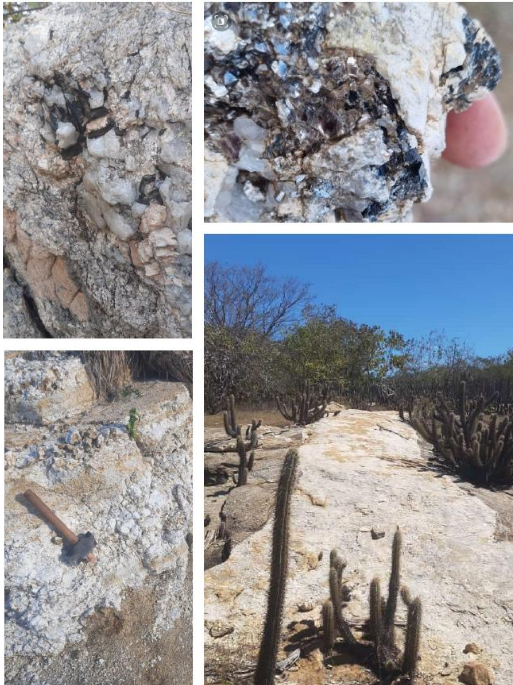
Figure 2. LCT pegmatite Outcrops and Surface Samples from vein in a North-Northeast direction and embedded in gneiss.

Pegmatite VM-EJ-01 is an LCT (Lithium-Cesium-Tantalum) pegmatite, since in addition to 3.72 Li 2 O, anomalous values of 554.5 ppm of Cesium and 135 ppm of Tantalum were recorded, accompanied by 177 ppm of Niobium and high values for Rubidium (>10,000ppm); Tin (675 ppm) and Zinc (387ppm). Initial fieldwork also detected two additional pegmatites with 2.15% and 1.58% Li 2 O, respectively, which led to the exploration and acquisition of the 10 claim blocks that make up the Jaguribe Property.