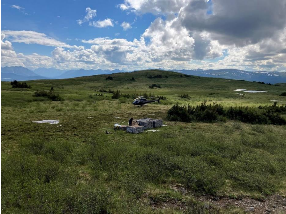
Figure 2. Golden Stranger Drill Core

The soil survey was completed in Fall 2023 and was centered around the main Golden Stranger historical showings on a grid 3 km wide by 2.8 km in length with 15 sample lines at 200 m spacing with samples along the lines collected at 100 m intervals. A total of 419 soil samples sites were examined and where possible sampled in 2023. Results have been received for a total of 335 samples with 8 samples returning greater than 50 ppb Au and 2 samples returning greater than 100 ppb Au up to 254 ppb Au. A total of 11 rock grab samples during 2023 were collected while soil sampling with 3 samples returning greater than 0.1 g/t Au up to 0.957 g/t Au. A total of 6 of the 11 rock grab samples yielded greater than 2 g/t Ag up to 7.4 g/t Ag. Most of the rock grab samples were collected near the north end of the main showings area.