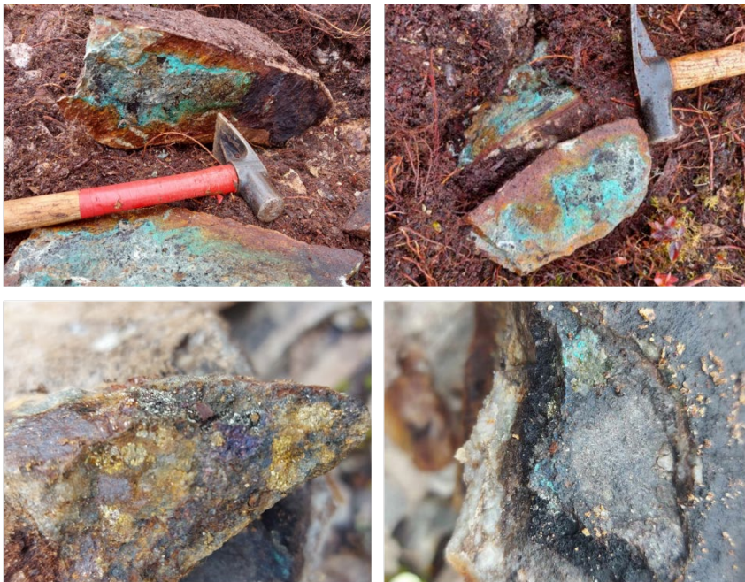
Figure 1: Copper mineralization at Bursey Property

As the Property was previously unexplored, new discoveries include significant zones of mineralization and extensive alteration characteristics associated with gold-bearing quartz veining. Multiple heavy mineralized bedrock and float samples were noted to contain copper while several quartz-carbonate veins with copper and gold pathfinder minerals were located (see Figure 4). These features appear promising for the presence of an orogenic gold-copper mineralization.