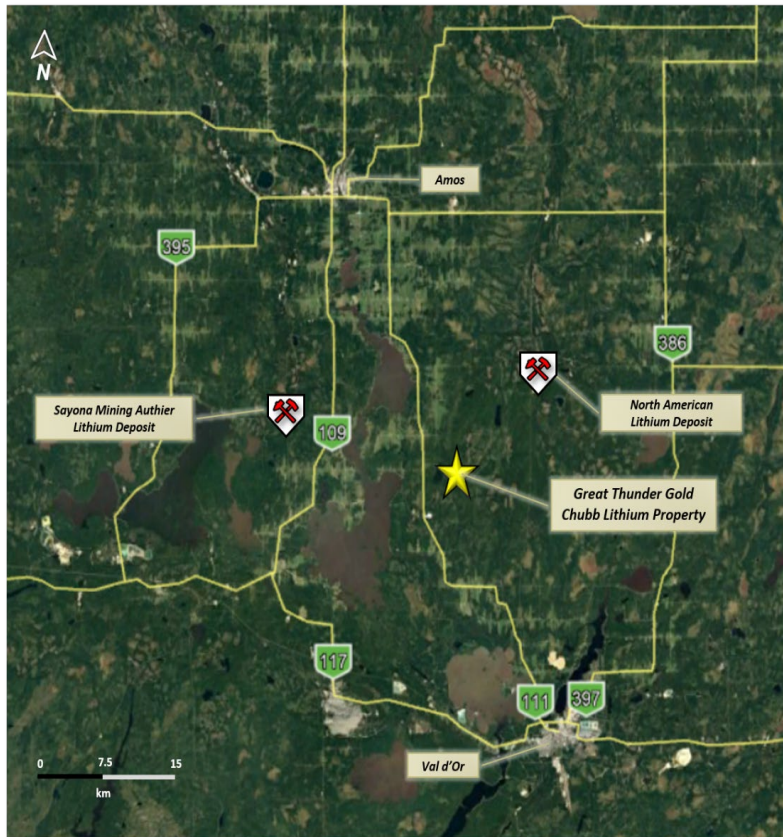
Figure 3: Regional location of the Chubb Property within the La Corne Pluton

In 2016, the Company optioned the Chubb lithium project located near Val d'Or, Quebec. In 2017, it exercised that option and acquired 100% of the claims, subject to a 1% net smelter returns royalty which can be repurchased for $200,000 and a 2% gross metal royalty.