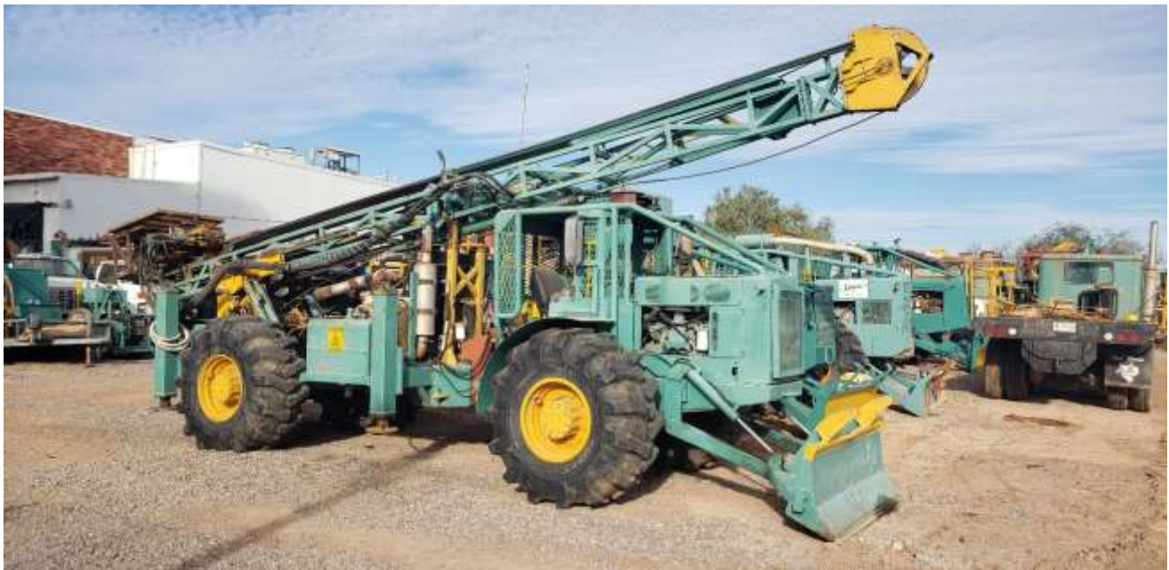
This drill rig will be used to drill DDH-3 and DDH-4