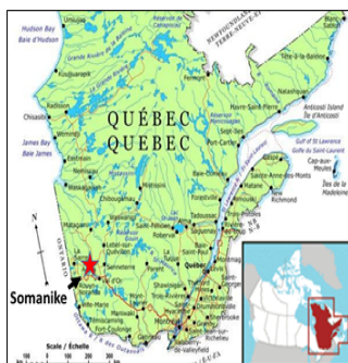
Figure 2 – Geographical location of Somanike Project

To maintain the option to the Somanike Property under the QPMC Option Agreement, the Company has issued 181,089 Common Shares to QPMC and 53,846 Common Shares to Globex Mining Enterprises Inc. Prior to exercising its option under the Legendary Somanike Option Agreement, the Company must pay QPMC $25,000 in cash prior to June 15, 2022 and $50,000 in cash prior to June 15, 2023. Also, prior to exercising the option on the Somanike Project, the Company must drill 750m of core on certain claims held by Globex Mining Enterprises Inc. As of December 31, 2021, the Company has paid QPMC an aggregate of $327,800 and has drilled the necessary 750m of core on certain claims held by Globex Mining Enterprises Inc.