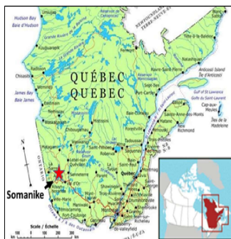
Figure 2 – Geographical location of Somanike Project

To maintain the option to the Somanike Property under the QPMC Option Agreement, the Company has issued 181,089 Common Shares to QPMC and 53,846 Common Shares to Globex Mining Enterprises Inc. Prior to exercising its option under the Legendary Somanike Option Agreement, the Company must pay QPMC $25,000 in cash prior to June 15, 2022 and $50,000 in cash prior to June 15, 2023. Also, prior to exercising the option on the Somanike Project, the Company must drill 750m of core on certain claims held by Globex Mining Enterprises Inc. As of December 31, 2021, the Company has paid QPMC an aggregate of $327,800 and has drilled the necessary 750m of core on certain claims held by Globex Mining Enterprises Inc.