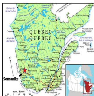
Figure 2 – Geographical location of Somanike Project

To maintain the option to the Somanike Property under the QPMC Option Agreement, the Company has issued 181,089 Common Shares to QPMC and 53,846 Common Shares to Globex Mining Enterprises Inc. Prior to exercising its option under the Legendary Somanike Option Agreement, the Company must pay QPMC $25,000 in cash prior to June 15, 2022 and $50,000 in cash prior to June 15, 2023. Also, prior to exercising the option on the Somanike Project, the Company must drill 750m of core on certain claims held by Globex Mining Enterprises Inc. As of December 31, 2021, the Company has paid QPMC an aggregate of $327,800 and has drilled the necessary 750m of core on certain claims held by Globex Mining Enterprises Inc.