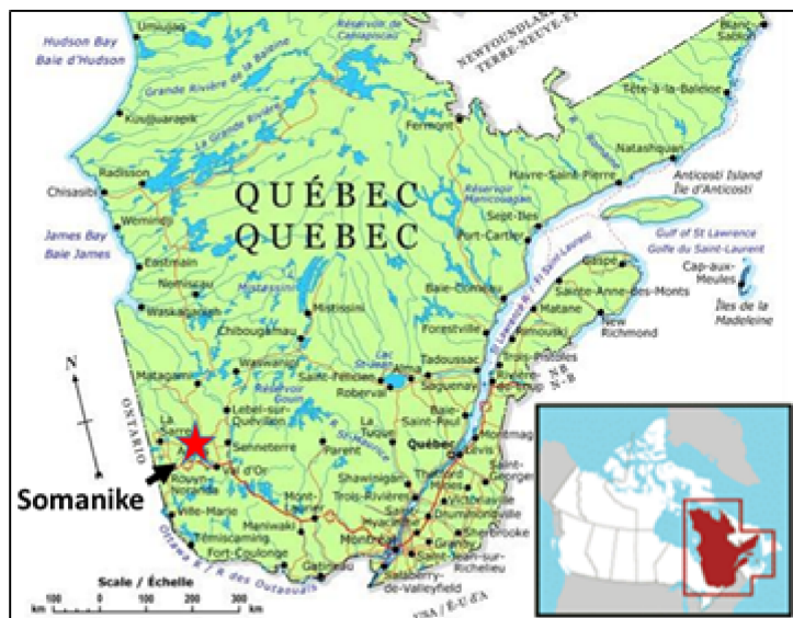
Figure 2 – Geographical location of Somanike Project

To maintain the option to the Somanike Property under the QPMC Option Agreement, the Company has issued 181,089 Common Shares to QPMC and 53,846 Common Shares to Globex Mining Enterprises Inc. Prior to exercising its option under the Legendary Somanike Option Agreement, the Company must pay QPMC $25,000 in cash prior to June 15, 2022 and $50,000 in cash prior to June 15, 2023. Also, prior to exercising the option on the Somanike Project, the Company must drill 750m of core on certain claims held by Globex Mining Enterprises Inc. As of December 31, 2021, the Company has paid QPMC an aggregate of $327,800 and has drilled the necessary 750m of core on certain claims held by Globex Mining Enterprises Inc.