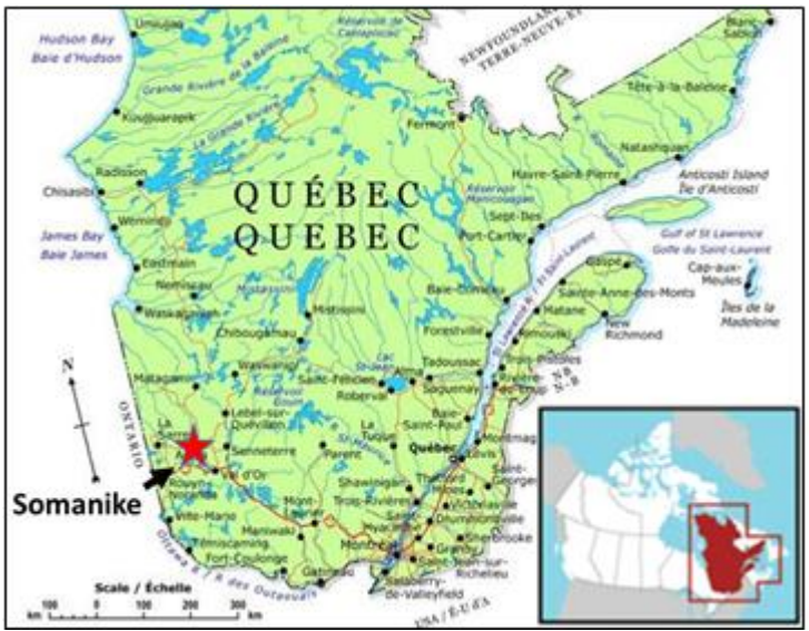
Figure 2 – Geographical location of Somanike Project

For the year ended December 31, the Company has spent the following amount on the Somanike property: