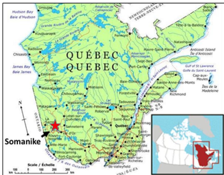
Figure 2 – Geographical location of Somanike Project

To maintain the option to the Somanike Property under the QPMC Option Agreement, the Company has issued 181,089 Common Shares to QPMC and 53,846 Common Shares to Globex Mining Enterprises Inc. Prior to exercising its option under the Legendary Somanike Option Agreement, the Company must pay QPMC $25,000 in cash prior to June 15, 2022 and $50,000 in cash prior to June 15, 2023. Also, prior to exercising the option on the Somanike Project, the Company must drill 750m of core on certain claims held by Globex Mining Enterprises Inc. As of June 30, 2021, the Company has paid QPMC an aggregate of $75,000 and has drilled the necessary 750m of core on certain claims held by Globex Mining Enterprises Inc.