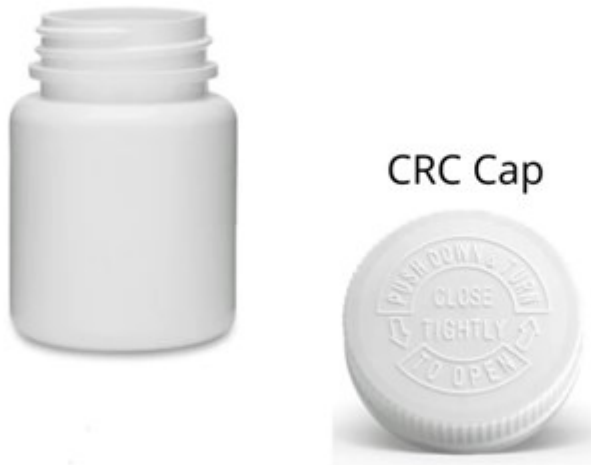
Image 1 - 40cc Pill Bottle and CRC Cap

To view an enhanced version of this graphic, please visit: