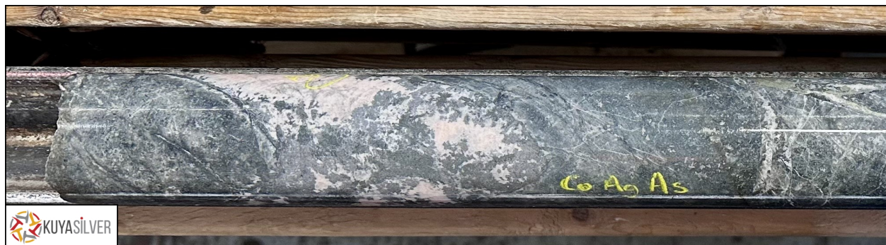
Figure 2: Silver-cobalt mineralized ladder vein grading 38 g/t Ag, 1.11% Co over 0.82 m (from 287.81 m) from hole 25-SK-01.